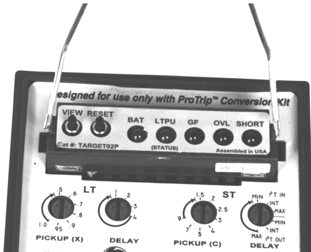
Figure 2. Target Module removal.

An installed Target Module is seated firmly in the Trip Unit. As shown in Figure 1, there are tabs at the sides of the Target Module for removal. A Rating Plug Removal Tool, catalog number TRTOOL, also known as an integrated circuit (DIP) extractor, is required to remove the Target Module. Grasp the tabs of the module with the tool, as shown in Figure 2. Be careful to hold the tabs and not the front cover, as the Target Module could be damaged otherwise. Gently pry the Target Module out by pulling away from the Trip Unit. A gentle left-right wriggling motion assists the removal. Insure that the tabs are held securely until the Target Module is completely removed.