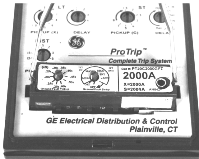
Figure 2. Rating Plug removal.

NOTE: La protection du disjoncteur n'est maintenue qu'à 25% de la valeur du transformateur de courant lorsque le calibreur est retiré. Si le disjoncteur est chargé à plus de 25% de la valeur du transformateur de courant, le disjoncteur se déclenchera après une période prédéterminée par une mnuterie.